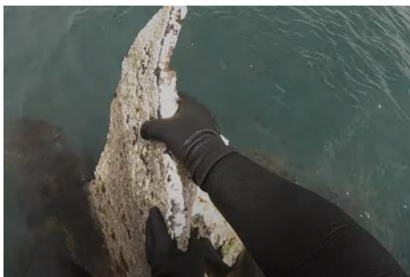
The only part of the structure visible now is a 'shark fin' at very low tides.