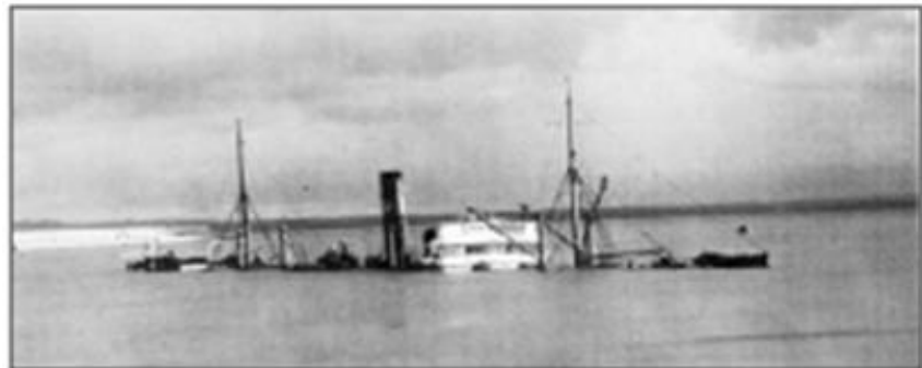
SS Asmund c.1931